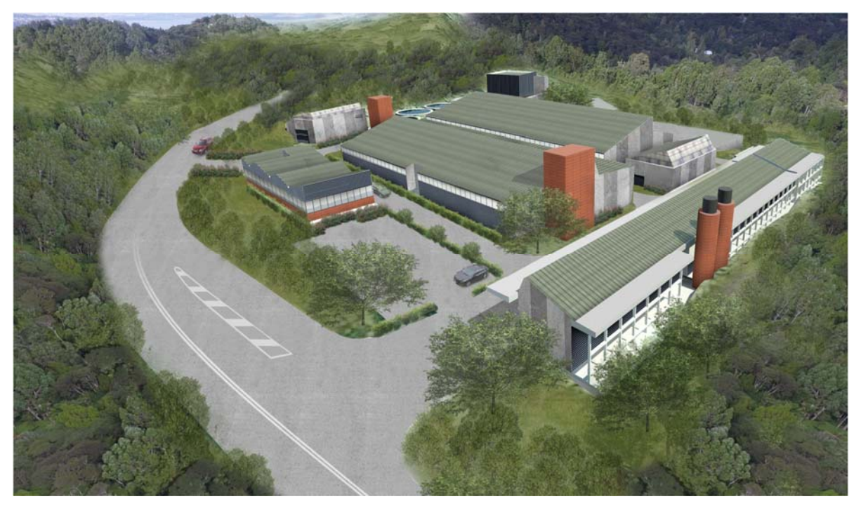
Figure 1. Artist impression looking east along Woodlands Park Road towards Titirangi Township, based on indicative plant design/layout

This report sets out the process that has been used to determine the preferred option and the reasons why this option has been selected.