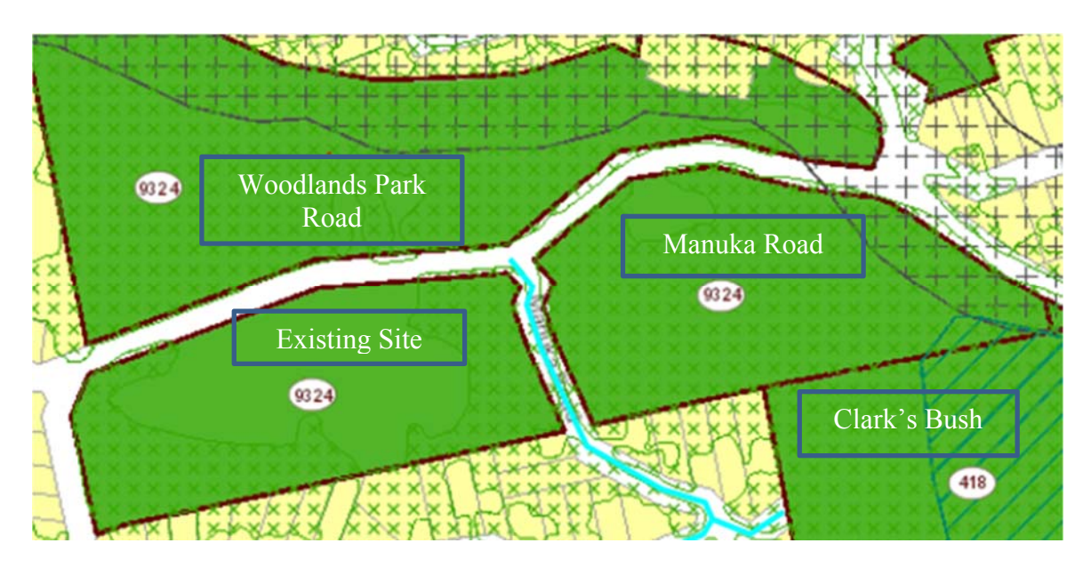
Figure 2: Designation – Showing all three sites